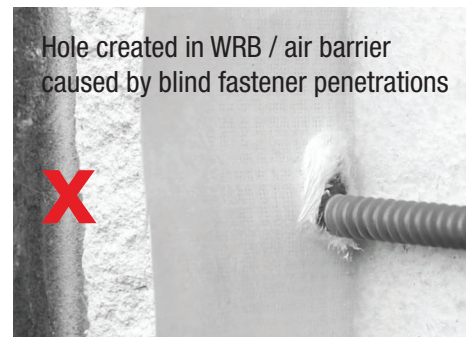
Hole created in WRB / air barrier caused by blind fastener penetrations

Generally tested and accepted industry fastening patterns for 2' x 4' mineral wool panels is 5 fasteners per panel.