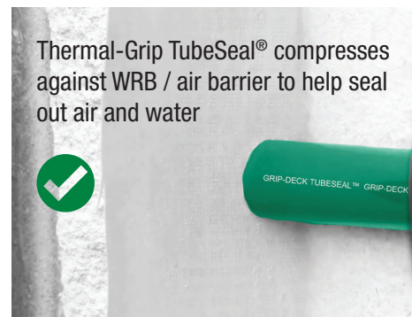
Thermal-Grip TubeSeal® compresses against WRB / air barrier to help seal out air and water