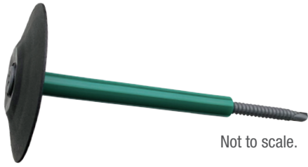
Not to scale.