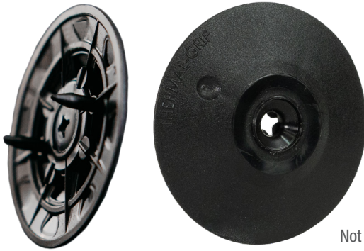
Not to scale.