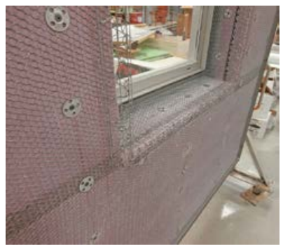
Note the insulation board has both vertical and horizontal drainage channels on the backside