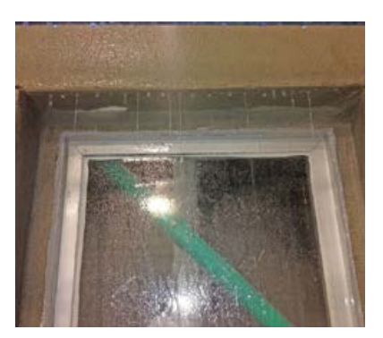
Stucco test wall on the water spray rig