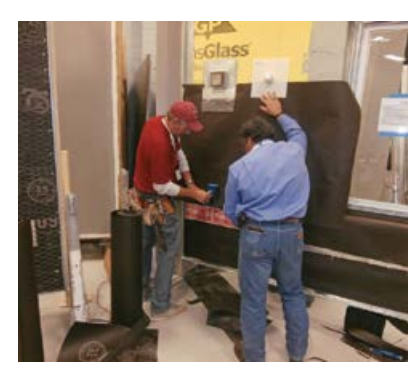
Building paper being applied to the base test wall and integrated with mechanical and window penetrations