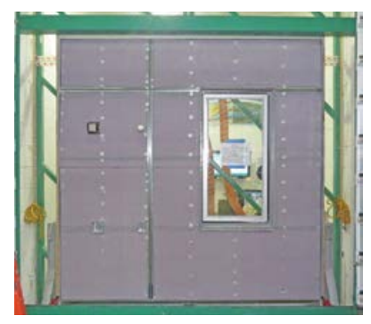
Lath attached over 2-inch rigid continuous insulation using large 11/4-inch diameter. Lath and plaster washers and corrosion resistant ceramic coated self-drilling screws; 8-foot by 8-foot test wall has been strapped to transparent test rig for E-331 moisture test.