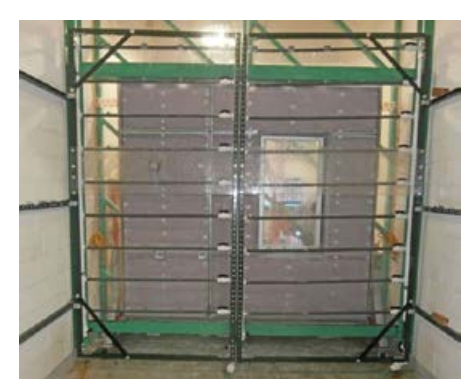
Lath attached over 2-inch rigid continuous insulation using large 1¼-inch diameter. Lath and plaster washers and corrosion resistant ceramic coated self-drilling screws.

In the case of a stucco test wall, the lath is applied along with the necessary control joints and terminations. The test wall bucks are strapped to a transparent wall and sealed around the perimeter. A calibrated and continuous amount of water is then sprayed on the outside surface of the wall assembly while a pressure differential is created inside of the wall simulating moisture drive through the assembly. Observers stand behind the