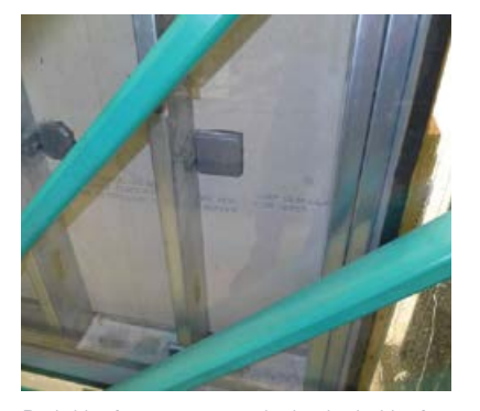
Backside of transparent test rig showing inside of the stud wall and sealed perimeter. Pressure differential is created behind the test wall to simulate moisture drive through the test wall specimen.